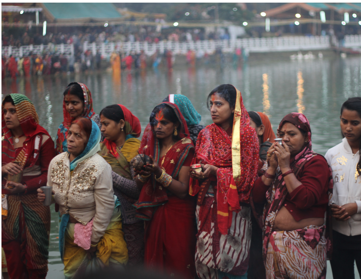
People celebrating Chhath Puja © Gagan Thapa

good carbon sink ecosystems, for example peatlands sink as twice carbon as to natural forests' biomass (Joosten and Couwenberg, 2008). As landscape and habitat, they regulate species diversity of >0.1 million